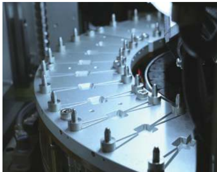
Pre-soak and Post-recovery